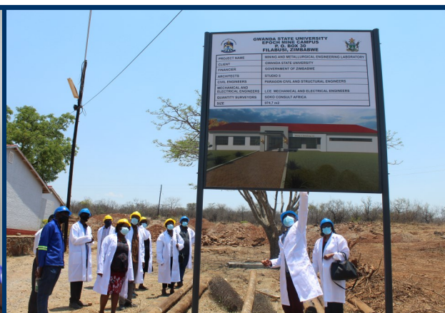
Tour at the construction site