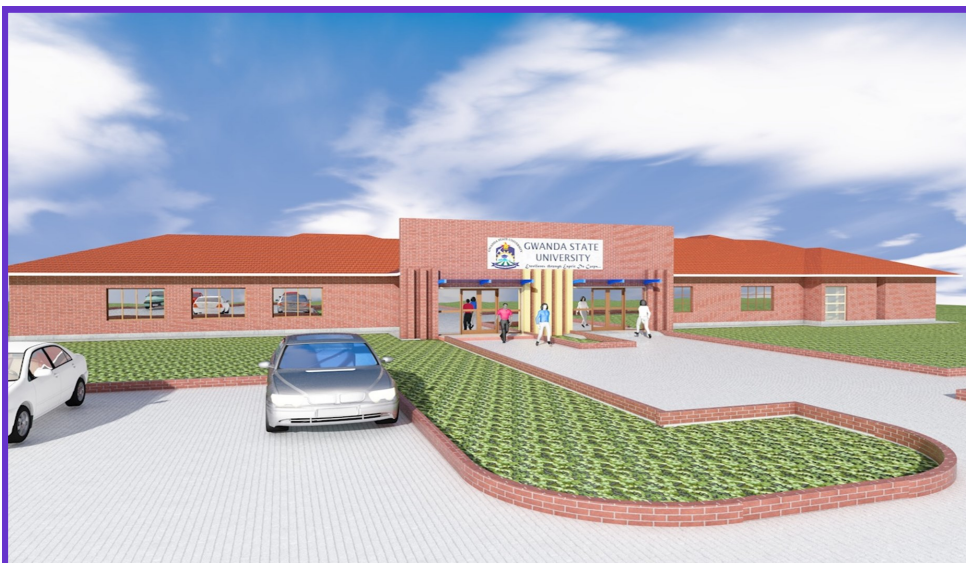
Artistic impression of the Lecture Block

This will also increase revenue for the University. Meanwhile, another construction project of the lecture block is set to kick off after modalities have been completed. Among other preliminary works that have been done in preparation for the commencement of the Lecture block construction include site clearing, Architectural drawing, electrical drawings and structural drawings, printing of drawings and procurement of some building materials.