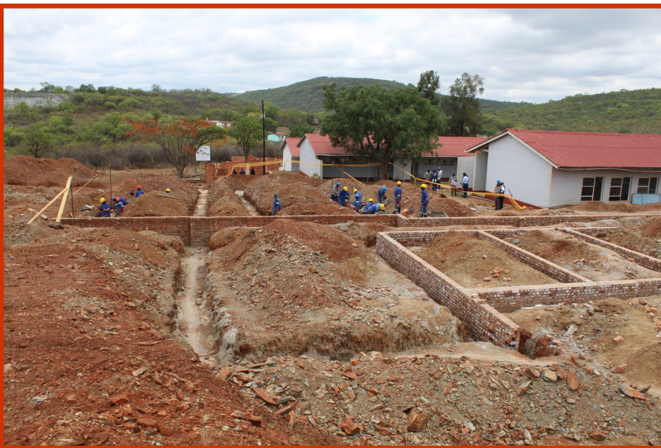
Part of the foundation construction of the Mining and Engineering Laboratory at Epoch Mine Campus

Laboratory is part of the implementation of Education 5.0 mantra by the Ministry of Higher and Tertiary Education, Innovation, Science and Technology Development.