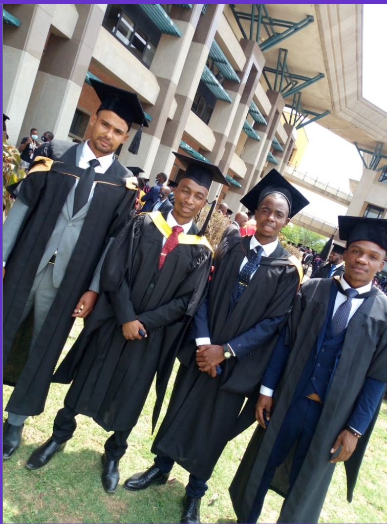
Some of the students who recently graduated under NUST

Greater achievements lie ahead for Gwanda State University as it looks forward to install the first Chancellor on the anticipated first graduation ceremony to be held in year 2022.