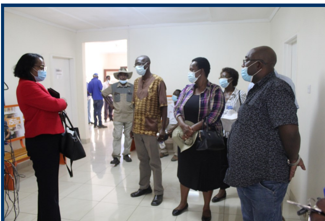
Tour inside the University Administration Block