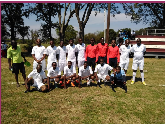
GSU Soccer dream team