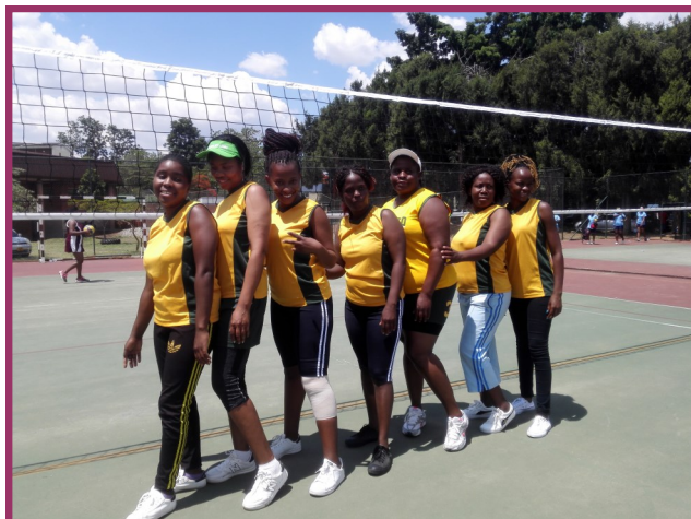
Ladies Volleyball team