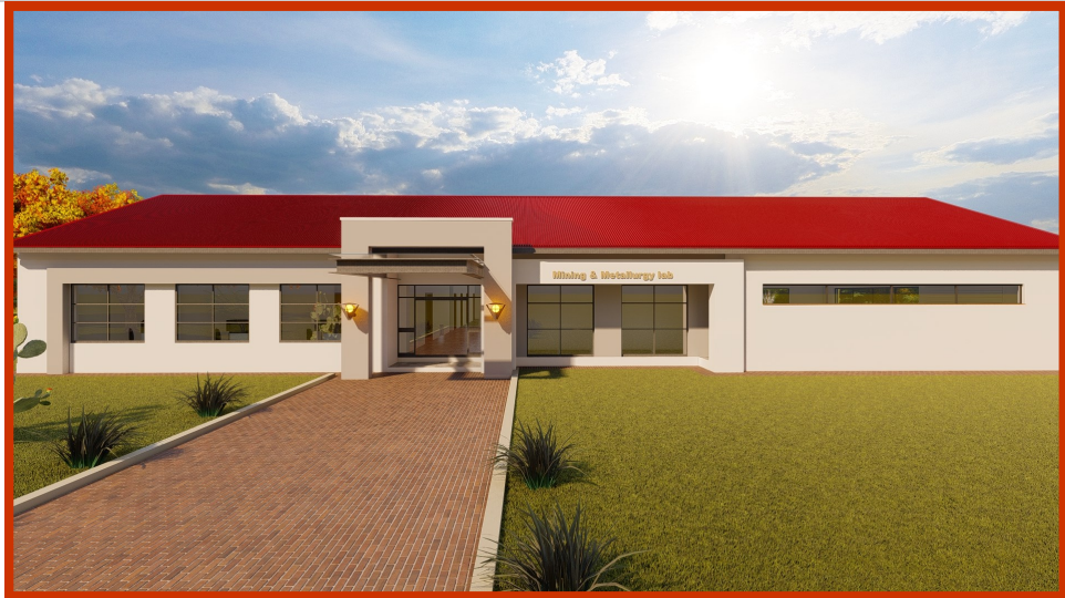
Artistic Impression of the Mining and Engineering Lab

The construction of the new Mining and Engineering -