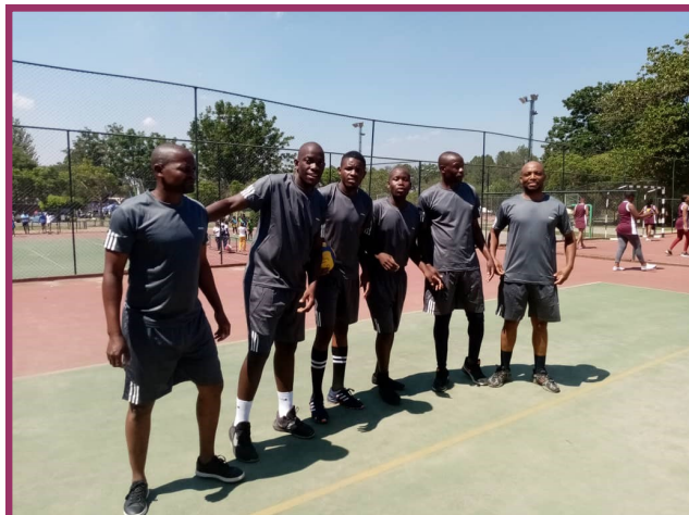
Male Volleyball team members